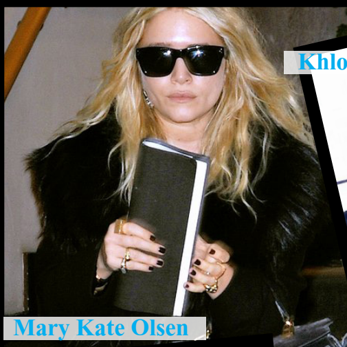
Mary Kate Olsen