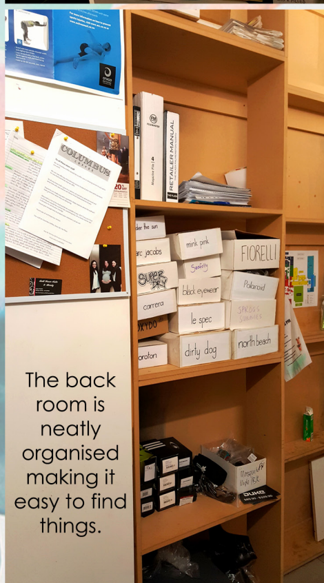
The back room is neatly organised making it easy to find things.