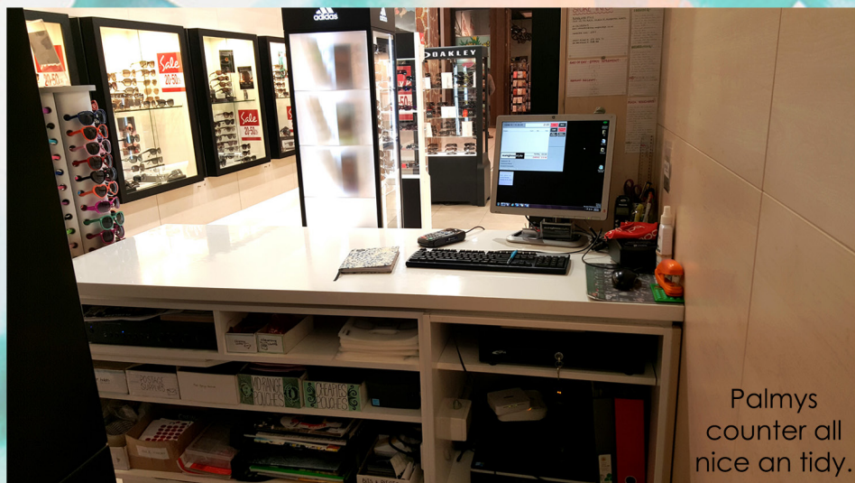
Palmy's counter all nice and tidy.