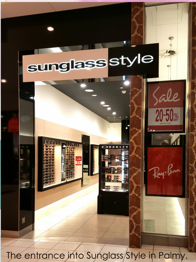
The entrance into Sunglass Style in Palmy.

The team at Palmy are a little family that works hard and keeps the store looking good.