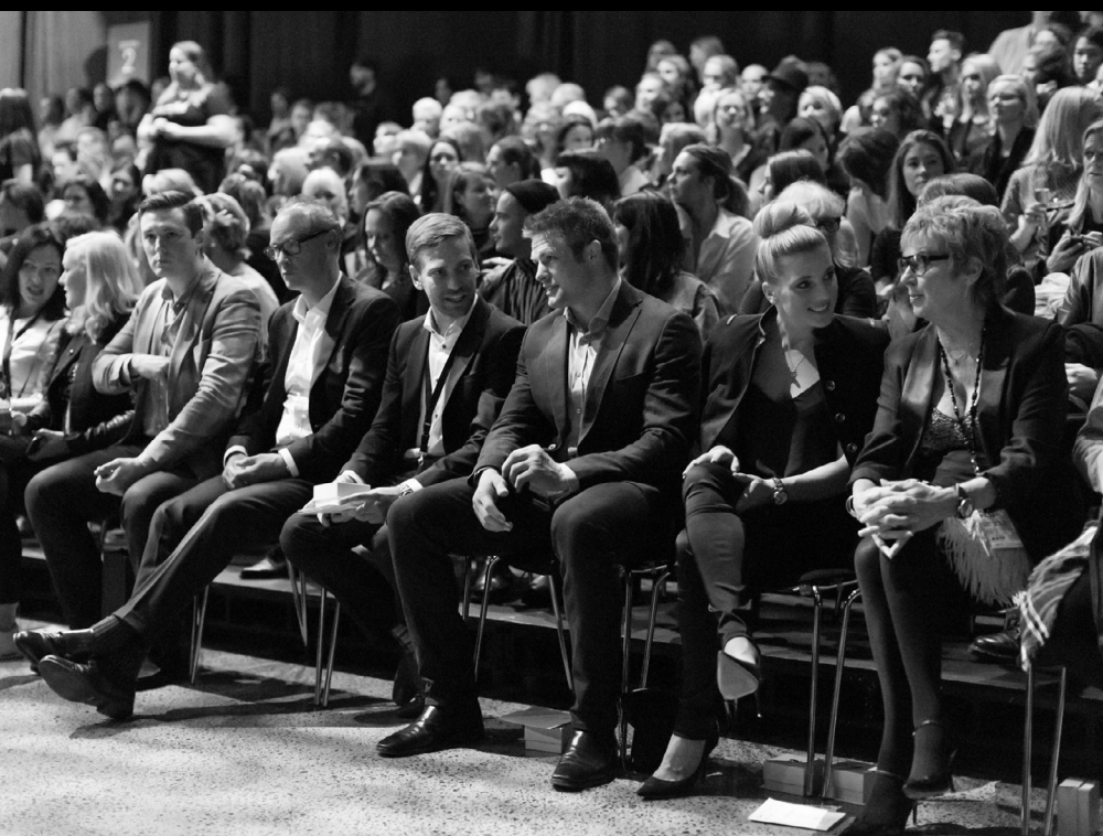
Richie McCaw was there!