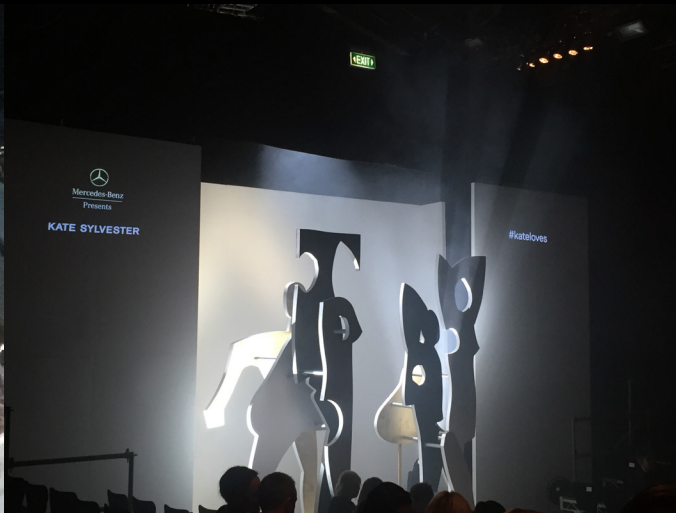
Kate Sylvester Autumn/ Winter 2016 Collection - "A Muse"