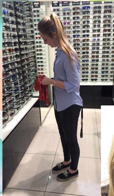
Clean them sunnies!