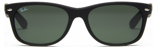
• RB 2132 NEW WAYFARER 55mm $220

The New Wayfarers are an updated take on Ray-Ban's classic wayfarer.