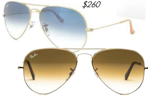
• RB 3025 AVIATOR 58mm $260

Ray-Ban Justin's are our Number 1 Top Selling sunglass. Great for all face shapes and sizes.