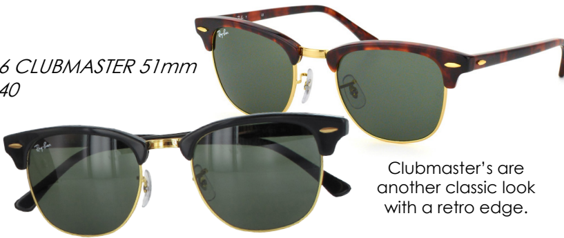
• RB 3016 CLUBMASTER 51mm $240

Clubmaster's are another classic look with a retro edge.