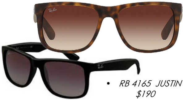
• RB 4165 JUSTIN 55mm $190

Here are the top selling Ray Ban styles that seem to fly off the shelves as soon as you have them in stock!