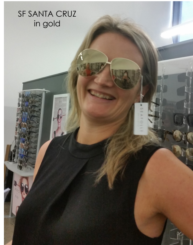
SF SANTA CRUZ in gold