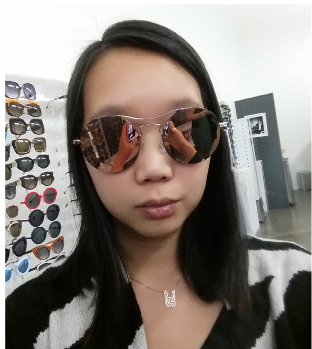
SF ENCINITAS in peony pink