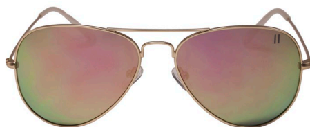
ELEVEN Los Angeles $99.90