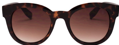
ELEVEN Paris $79.90