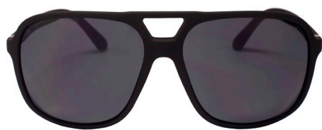
ELEVEN Milan $79.90