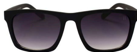
ELEVEN Auckland $79.90