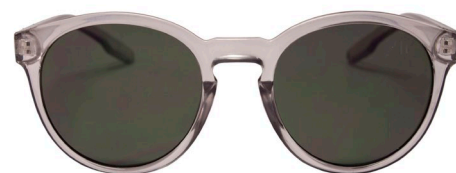
ELEVEN Shanghai $79.90