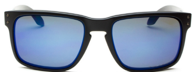
3. HOLBROOK OO9102-52 Mt Blk / Ice Irid