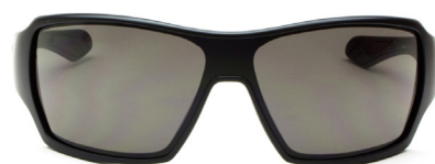
5. OFFSHOOT OO9190-01 Mt Black / Warm Grey