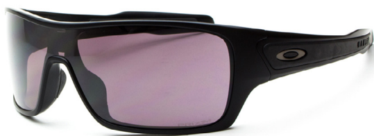
1. TURBINE ROTOR OO9307-07 MT BLK PRIZM