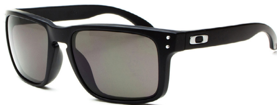
2. HOLBROOK OO9102-01 MT BLK / WARM GREY