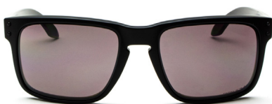
4. HOLBROOK OO9102-90 Covert Mt Blk / Prizm Pol