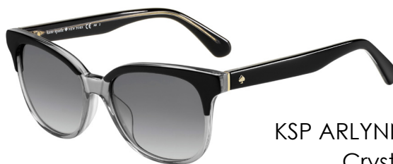
KSP ARLYNN/S 08A 52 90 Crystal Black