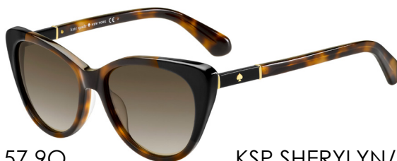
KSP SHERYLYN/S 581 54 HA Havana