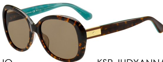
KSP JUDYANN/P/S FZL 56 SP Havana