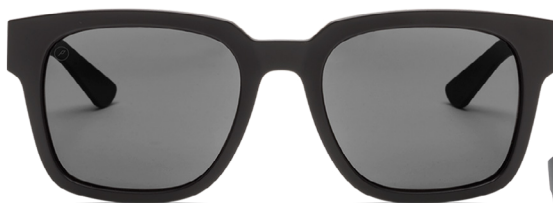
EC ZOMBIE Matte Black / Grey