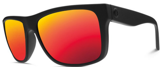
EC SWINGARM Matte Black / Fire Chrome