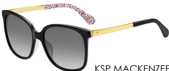
KSP MACKENZEE/S UYY 57 90 Black