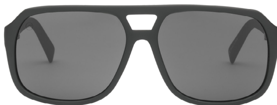
EC DUDE Matte Black / Grey