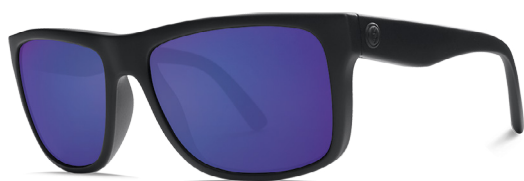
EC SWINGARM Matte Black / Blue Chrome