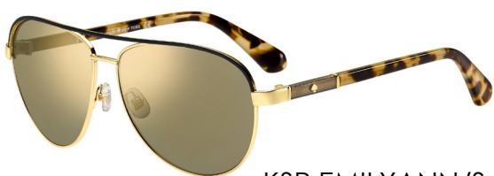
KSP EMILYANN/S 0NR 59 JO Havana Gold / Gold Flash