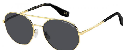
MARC 327/S - $299.90

Putting a contemporary twist on the classic Aviator with rimless lenses and a flatter frame front, this over-sized guys frame will look great on women too.