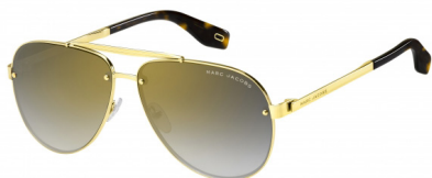
MARC 317/S - $339.90

Putting a contemporary twist on the classic Aviator with rimless lenses and a flatter frame front, this over-sized guys frame will look great on women too.