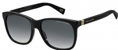
MARC 337/S - $229.90

Slightly edgier than your average round sunglass, the angles on this frame give an architectural feel to this otherwise simple shape.