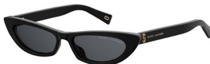
MARC 403/S - $339.90

A Purrr-fect cats-eye frame! Totally wearable and totally cool, this frame fits like a dream and looks gorgeous on, with a price that can't be beat!