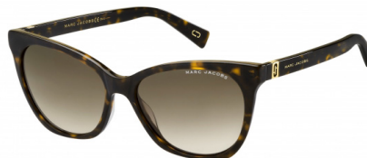
MARC 336/S - $229.90

Find easy everyday style with this perfectly proportioned frame. The rounded off rectangle will suit so many face shapes and offers a traditional look for our more conservative customers.