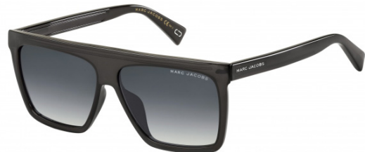
MARC 322/G/S - $259.90

Reminiscent of our fave flat-tops from years gone by, the unisex 321 and 322 offer cool oversized styling, with a subtle tonal stripe across the top. Off-duty cool for guys and gals.