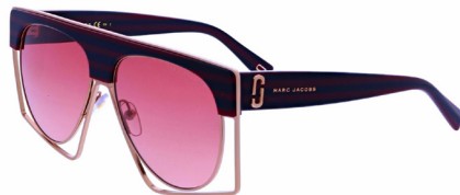
MARC 312/S - $469.90

Our crazy-cool ADV pc for the season, this unique pair has a clean square top and outer wireframe for an art-like silhouette.