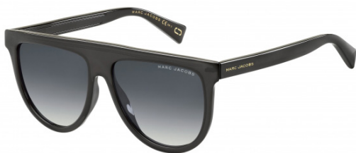
MARC 321/S - $259.90

Our crazy-cool ADV pc for the season, this unique pair has a clean square top and outer wireframe for an art-like silhouette.