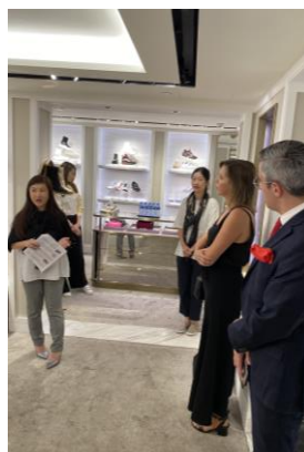
The Jimmy Choo 2020 release