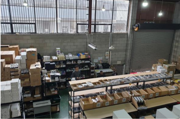
Stock in the warehouse, just a small part of our operation!

Sunglass Style was started by Sven and Lisa back in 2004! We have grown from one small store in Hornby Christchurch to a nationwide chain of 14 stores, representing some of the best brands in the world. We love sunglasses, we are those people you see at night wearing sunglasses, we would wear them to bed if we could! We are passionate about finding the right sunnies for everyone with our eyewear collections encompassing all price ranges, categories and styles.