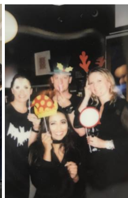
Xmas Party Antics!