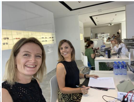
Selecting ranges at Safilo Showroom in Hong Kong