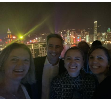
Taking in the HK light show with the Dior Team