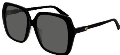
35466 GG GG0533SA 001 BLACK