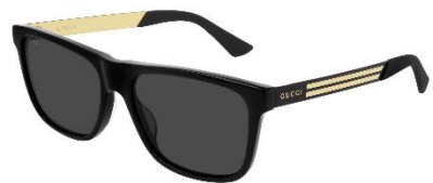
36975 GG GG0687S 001 Matte Black/Grey