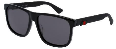
31550 GG GG0010S 001 BLACK/GREY