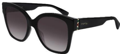
32685 GG GG0459S 001 BLACK/GREY