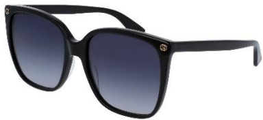
26423 GG GG0022S 001 BLACK/GREY GRAD