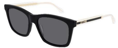
1016072 GG GG0558S001 Black/Grey