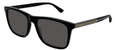
37310 GG GG0381S 006 Black/Grey