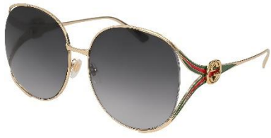
30434 GG GG0225S 001 GOLD/GREY GRAD