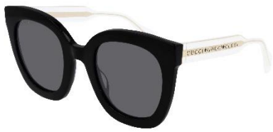
1016070 GG GG0564S 001 Black/Grey