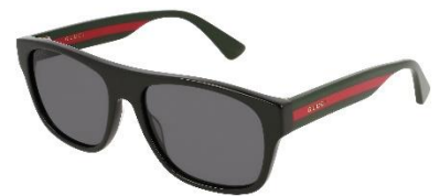
31665 GG GG0341S 001 BLACK/GREY